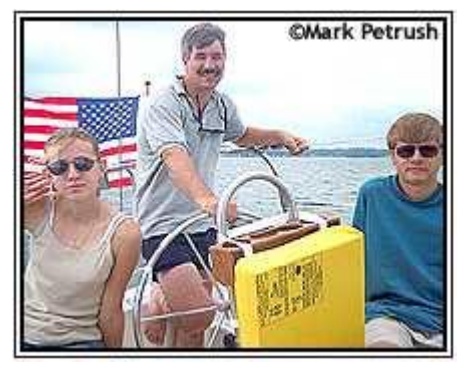
Properly observing flag etiquette can add fun to your time on the water.

We don't see masthead burgees much these days because flying them up there risks damaging some expensive equipment and destroying the flag with chafe. This is why many people opt to fly the burgee lower in the rig, hoisted to the end of the lowest starboard spreader on a flag halyard. While this practice is decried by purists, it is a reasonable adaptation of another tradition, which is that the starboard rigging is a position of honor (when we visit a foreign