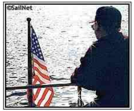
From sunup to sunset, it's appropriate to fly the ensign, except when racing.

The Ensign Boats should fly the national flag, and most pleasure boats in US waters have a choice between two of them. One is the yacht ensign, with its fouled anchor over a circle of 13 stars, and the other is the familiar 50-star flag. While some yacht clubs specify that one or the other be flown, discretion often lies with the skipper, except that the 50-star flag must be flown by any boat outside US waters and also by documented boats in all waters.